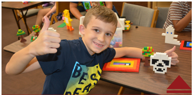
LEGO MAKE AND TAKE