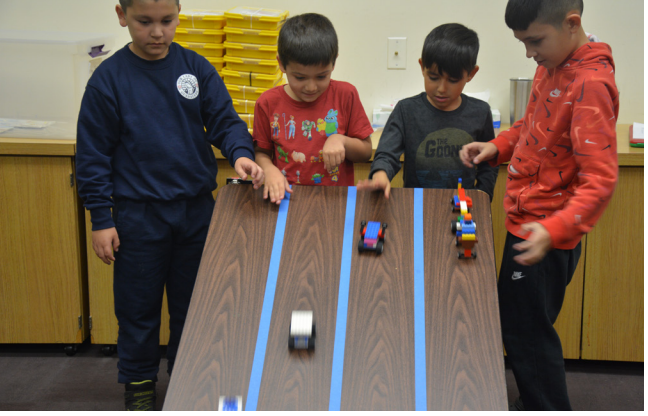
Lego Racers: First we built, then we raced!