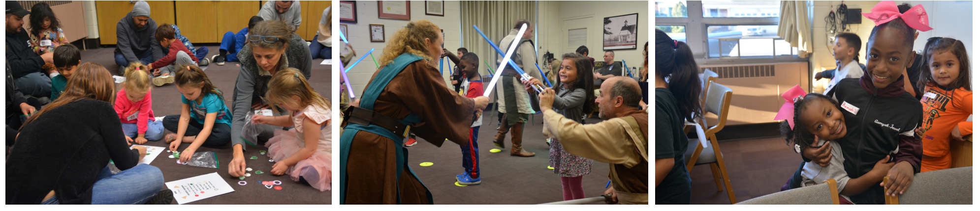
Hello Friends: Ciao Amici