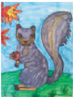
Photo Frame Fun (dpj019) 4 years – grade 1 Monday, September 21: 4:30pm Themed storytime fun featuring books, activities, and a craft. Register to receive link; be sure to enter your email in the notes field. Craft supplies will be available beginning Monday, September 14th, please call to schedule pick up appointment.